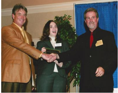
2006 North Alabama ABC Excellence in Construction Award