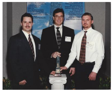
North Alabama Excellence in Construction Award