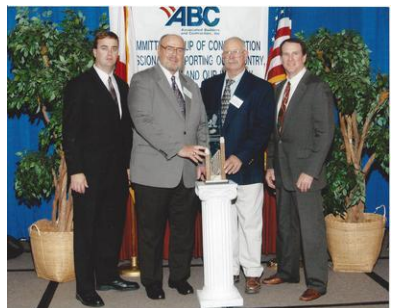
North Alabama Excellence in Construction Award