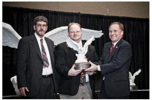
2007 National Excellence in Construction Award