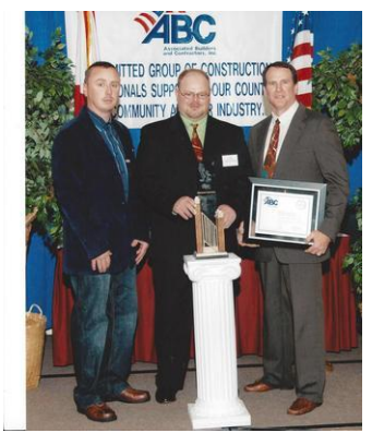
2009 North Alabama Excellence in Construction Award