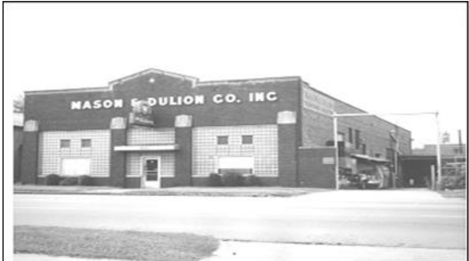
Mason & Dulion Co., Inc. building in Birmingham, AL.