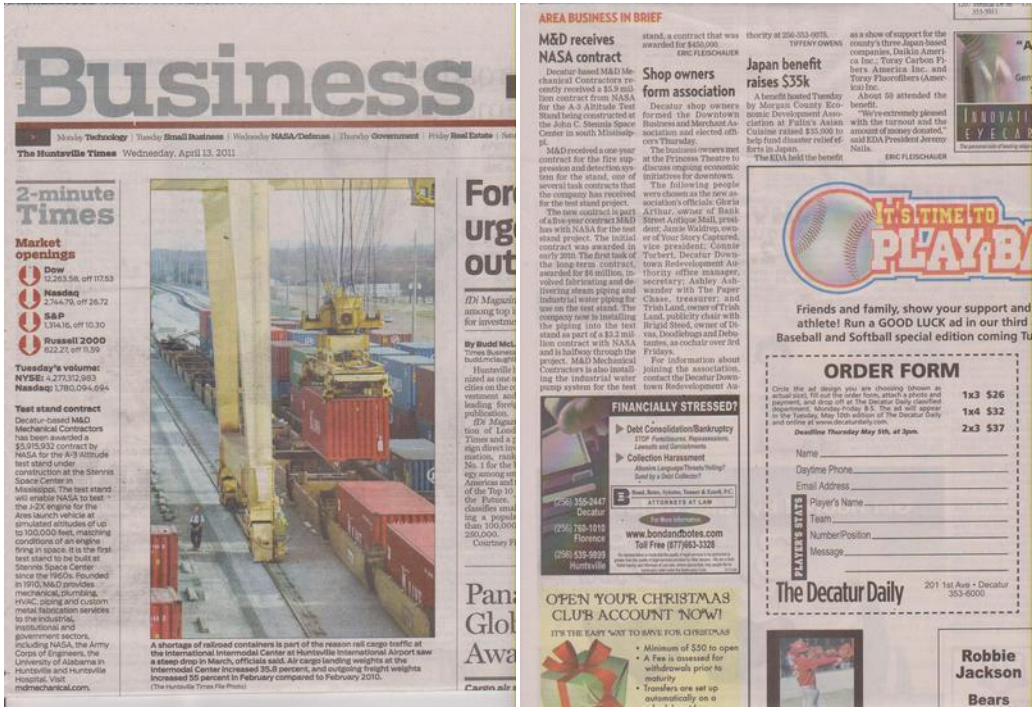
M&D Mechanical Contractors began work on the A-3 Altitude Test Stand at Stennis Air Force Base in Mississippi in 2010.